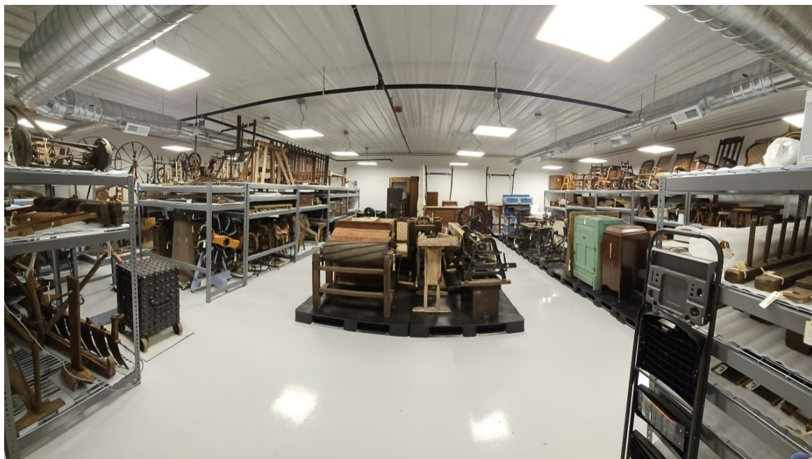
Rankin Center Collections storage